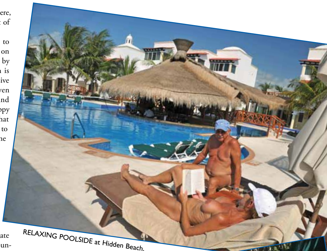
RELAXING POOLSIDE at Hidden Beach.

Cabanas Copal—the long-standing low-cost place to stay and the home of Tulum's nude beach—has lost their lease and the buildings have been evacuated. The upscale and pricy Azulik located immediately to the south remains open. Nude use of the beach continues with users accessing the beach via Club de Playa located to the north of Copal, and walking