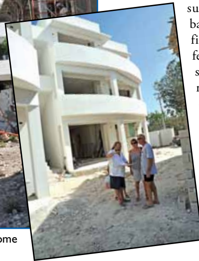
MIKE HOBSON EXPLAINS THE MAK NUK VILLAGE PROJECT to some visitors.

south to the area in front of Copal. This traditional nude use area has been free of police interference, and the only known arrest involved a man whose nude walk greatly exceeded the nude beach area.