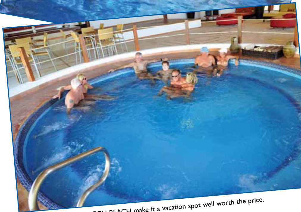
THE AMENITIES AT HIDDEN BEACH make it a vacation spot well worth the price.