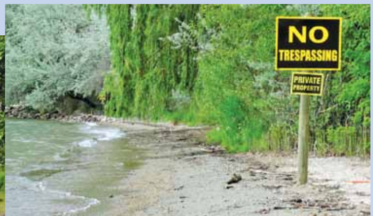
Property owners have posted No Trespassing signs on the beach.